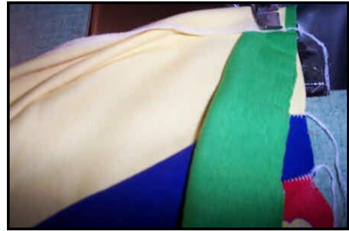
Step 8: fold over front (ribbing is sandwiched between front and neck) sew through all layers. Adjust your ribbing to neck, and continue sewing neckline, stretch ribbing gently