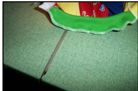
Step 10: view of neckline- wrong side