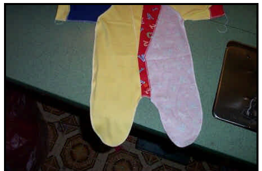
Step 6: sew, starting at one sleeves, all the way around the body, ending at the other sleeve