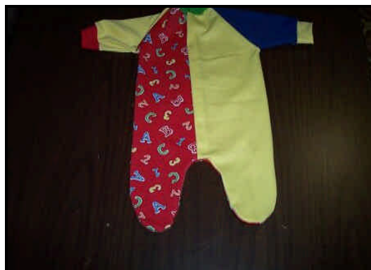
Step 11: weave in all serger tails, turn right side out, ad snaps