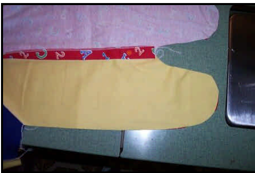
Step 5: Right sides together, match front & back, fold fronts over, pin.