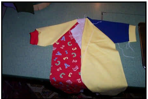
Step 4 sew ribbing to both sleeves