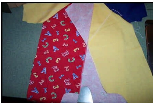
Step 3: serge both fronts for finished look