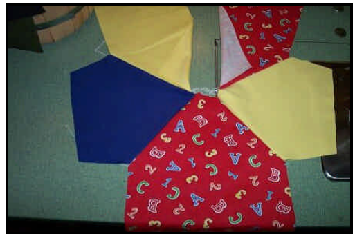
Step 2: sew both fronts to sleeves