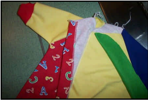
Step 7: Sew ribbing to neckline. Cut ribbing in an angle. Place right sides together on neckline