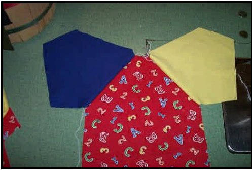
Step 1: sew both sleeves to back